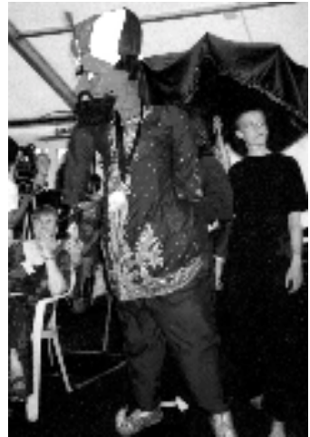
The Sultan enters for his audience with Mary Fisher

The final performance for all those attending the Quaker Summer Gathering in Canterbury left the QYT members feeling that all their hard work and long days were well worth the effort.